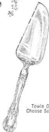
Towle Old Master Cheese Server, $7.00